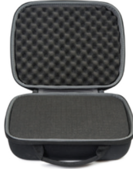
PN: STA-300-B22 Model 320 Case Black: Foam Weight: 410 gr. (0.9 lbs)