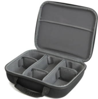
PN: STA-300-B23 Model 320 Case Black: Pouch & Divider Weight: 490 gr. (1.08 lbs)