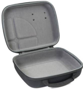
PN: STA-300-B21 Model 320 Case Black: Empty Weight (Empty): 320 gr. (0.7 lbs)