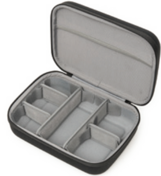
PN: STA-300-B18 Model 315 Case Black: Pouch & Divider Weight: 360 gr. (0.79 lbs)