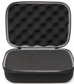
PN: STA-300-B17 Model 315 Case Black: Foam Weight: 350 gr. (0.77 lbs)