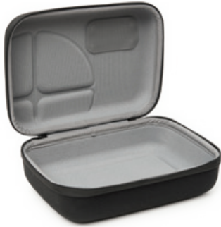
PN: STA-300-B16 Model 315 Case Black: Empty Weight (Empty): 280 gr. (0.61 lbs)